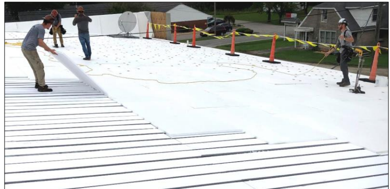
Roofers installing Cellofoam FR Composite Sheets over Cellofoam Flute Fill.

Manufactured to your Needs: Cellofoam® FR Composite Sheet is available in 4 x 8 ft boards of thickness 1 to 6 inches, and ASTM C578 nominal densities of 1.0, 1.25, 1.5, and 2.0 lb/ft 3 .